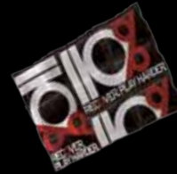
ICE SHEET INSERT

Ice restricts the blood vessels to prevent the accumulation of fluids and reduce inflammation and pain. Compression + Ice immediately reduces swelling, aids in soft tissue recovery and helps reduce numb sore tissue to prevent future injury.